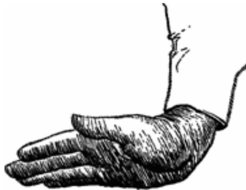
Fig. 12. The way the right hand should move from the wrist in the early backward break—straight back toward the outside of the forearm, with no turning or rolling.

This motion of the hand, straight back, is the backward wrist break.