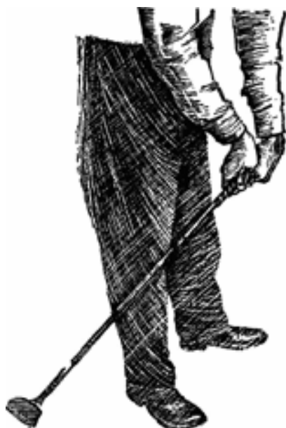
Fig. 14A. How the backward break looks from the side. Note the bend in the left wrist as the back of the hand turns down, and the position of the right wrist. Notice also that the face of the club has not opened.

This is a key move - the foundation of the swing - and you must do it right, get the feel of doing it right, and do it so much that it becomes automatic. It is easy to practice, requiring very little room, and can be worked on indoors or out, winter as well as summer. Get it, and get it right.