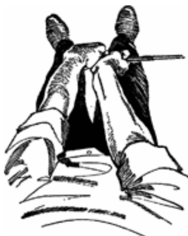
Fig. 15. Here is what you should see when you make the backward break perfectly - only one knuckle of the left hand but two knuckles of the right.

The closer you bring this motivating force to the axis of the swing (the spinal column) the better the swing will be.