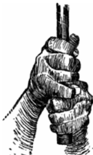
Fig. 6. The completed grip with the club held up, showing how the little finger of the right hand overlaps the index finger of the left.

The overlapping grip gives us a better chance to maintain full and tight contact with both hands at all stages of the swing. And this we must have.