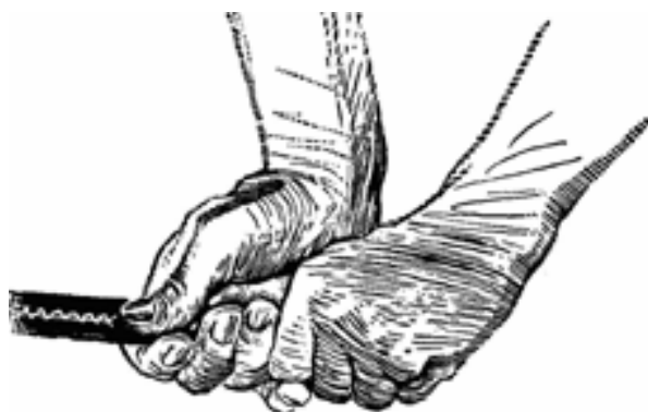
Fig. 13B. How not to make the break. Wrists and hands have rolled, the back of the left hand has turned upward. The right hand is rolling too, instead of bending straight back.