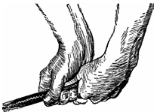
Fig. 13A. How the backward break is made, with the heel of the right hand pressing down on the knuckle of the left thumb. The back of the left hand begins to turn down and under.

To make the backward wrist break we merely push the heel of the right hand down against the big knuckle of the left thumb. This is a downward pressure of the heel on the thumb. When it is done, without moving the hands otherwise, the right hand breaks backward at the wrist and the left hand breaks forward or inward, the back of the left hand going under and facing, in a general way, toward the ground ( Fig. 13 ).