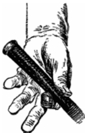
Fig. 2. Inside the left hand. The important point here is that the club lies diagonally across the palm, from the crook of the index finger, and comes out halfway between the root of the little finger and the base of the palm. There must always be a fold of flesh between the club and the root of the little finger.

It has been said that the grip with the right hand is a finger grip. This is true. But what part of the fingers? There is only one place that is correct, and that is at the very base or root of the second and third fingers, where they meet the palm. This is the best place because there the club can be held most securely. There is not only less chance but less inclination, with such a grip, to loosen the hand at the top of the swing or anywhere else. Such a grip, because it is at the very edge of the palm, makes for a tighter connecting joint between arm and club, with less give than any other. It transmits more power when the ball is struck ( Fig. 3 ).