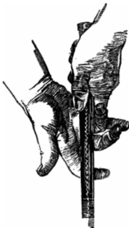
Fig. 3. How the right hand goes on. Here the club lies definitely in the fingers, but at the very roots of the second and third digits, with the forefinger getting ready to hook low around the shaft.

You will find that the palm of the right comes up and faces directly to the left, and that the center of the base of the right hand fits snugly over the big knuckle at the base of the left thumb. Both thumbs will be on the shaft, the left lying a little to the right of the top (at about 2 o'clock in aviation parlance) and the right lying to the left of the top, at about 10 or 10:30 o'clock. The well-known V's, formed by the folds of flesh between the thumb and fore-finger of each hand, should both point a shade to the right of the chin, to about the inside joint of the collar bone ( Fig. 5 ).