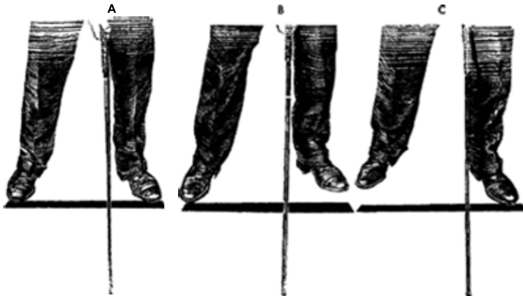
Figs. 7A, 7B, 7C. The three possible stances: square (7A), open (7B) and closed (7C). The only difference in the latter two is the degree to which they are open or closed.

You will be able to work into the open and closed stances later, using them for certain shots and to influence a particular swing you want. But while you are learning the method given here, content yourself with the square stance. It presents no problems and requires no adjustments.