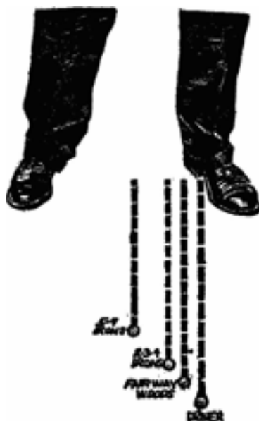
Fig. 11. Where to place the ball. The four basic positions: for the driver, for the fairway woods, for the long irons, for the medium and short irons.

We realize that some of the touring pros have advised playing the ball about opposite the left heel for all shots and merely moving the right foot closer to the left as the clubs rise in number. This is fine for the pros, who move into the ball so well on all shots. But the average player doesn't move nearly that well. It is much easier for him to get the more lofted irons through the ball with a descending club-head arc if the ball is at the midpoint position.