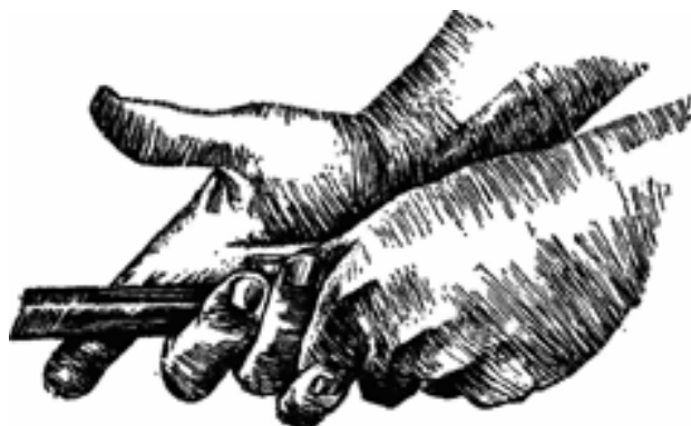
Fig. 4. The right hand fitting against the left, with the center of the base of the right palm moving onto the big knuckle at the base of the left thumb.

Incidentally, one of the club manufacturers has a small ridge-line running down the underside of all its grips. This fits perfectly into the groove at the base of the fingers of the right hand, and practically locks the player into the correct right-hand position.