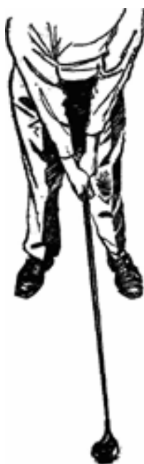
Fig. 9A. The "open body" stance, a common fault, with the body slouched and turned a little too easily toward the target. Note that the shaft of the club points to the right of the player's trousers fly.

The squaring around of the hips and shoulders is more difficult if the foot stance is open. It is easier when the foot stance is square, easiest of all when the stance is closed. That is why, as a matter of fact, it is easier to hook a ball from a closed stance than from an open one. The club is coming farther from the inside because the body is square to the ball, or facing a shade to the right.