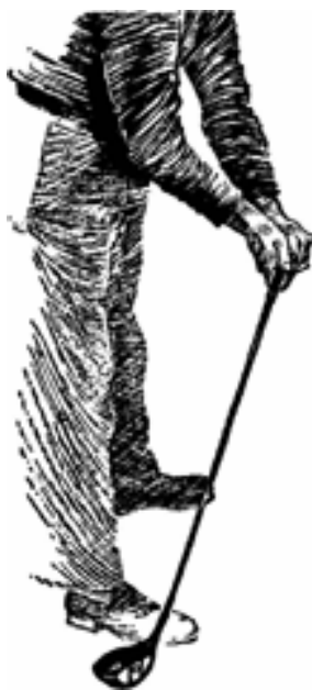
Fig. 14B. The wrong break, with wrists rolled. Note the difference in the left-hand position here and in Fig. 14A, and observe also the differences in the club-face positions. Never do it like this.

We have not put this into the actual swing yet, remember. We are still working on the mechanics of the wrist break. It is just possible that at this fundamental stage you will refuse to believe that you can hit the ball with such a break. So make this test: