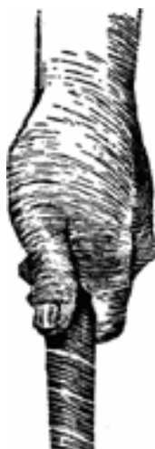
Fig. 1. How the left hand should look on the club. The Back of the hand is facing left, not up, two knuckles are visible, the thumb lies a little to the player's right on the shaft, and the V, between thumb and forefinger, points slightly to the player's right.

So much emphasis has been put on the left hand over the years that many people believe the right doesn't amount to much in the grip. They couldn't be more wrong. The right hand is very important, both in the way it grasps the club and in the way it fits against the left. Let's take the club first.