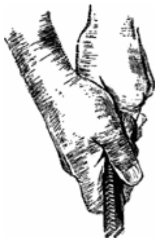
Fig. 5. The completed grip. Here we see the two knuckles of the left hand and the strong right hand, with the forefinger hooked low around the shaft and the V's pointing somewhat to the player's right hand. The right hand V always point more to the right than that of the left because of the position of the club at the roots of the fingers.

Ridge-line or not, however, this is the overlapping grip we must have. Its principal points are that the hands are opposed, the left has a palm-and-finger contact, the right a finger grip alone - and that only two knuckles of the left are visible at address.