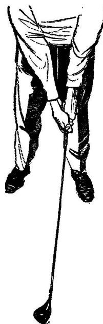
Fig. 9B. The correct position, with the body square to the projected line of flight and the club pointing to the left of the player's trousers fly. Note, too, how the squaring of hips and shoulders changes the position of the hands and club.

We have had pupils with pretty good swings who found it almost impossible to take a straight divot, for instance. They persisted in swinging from the outside. Once they were shown the little